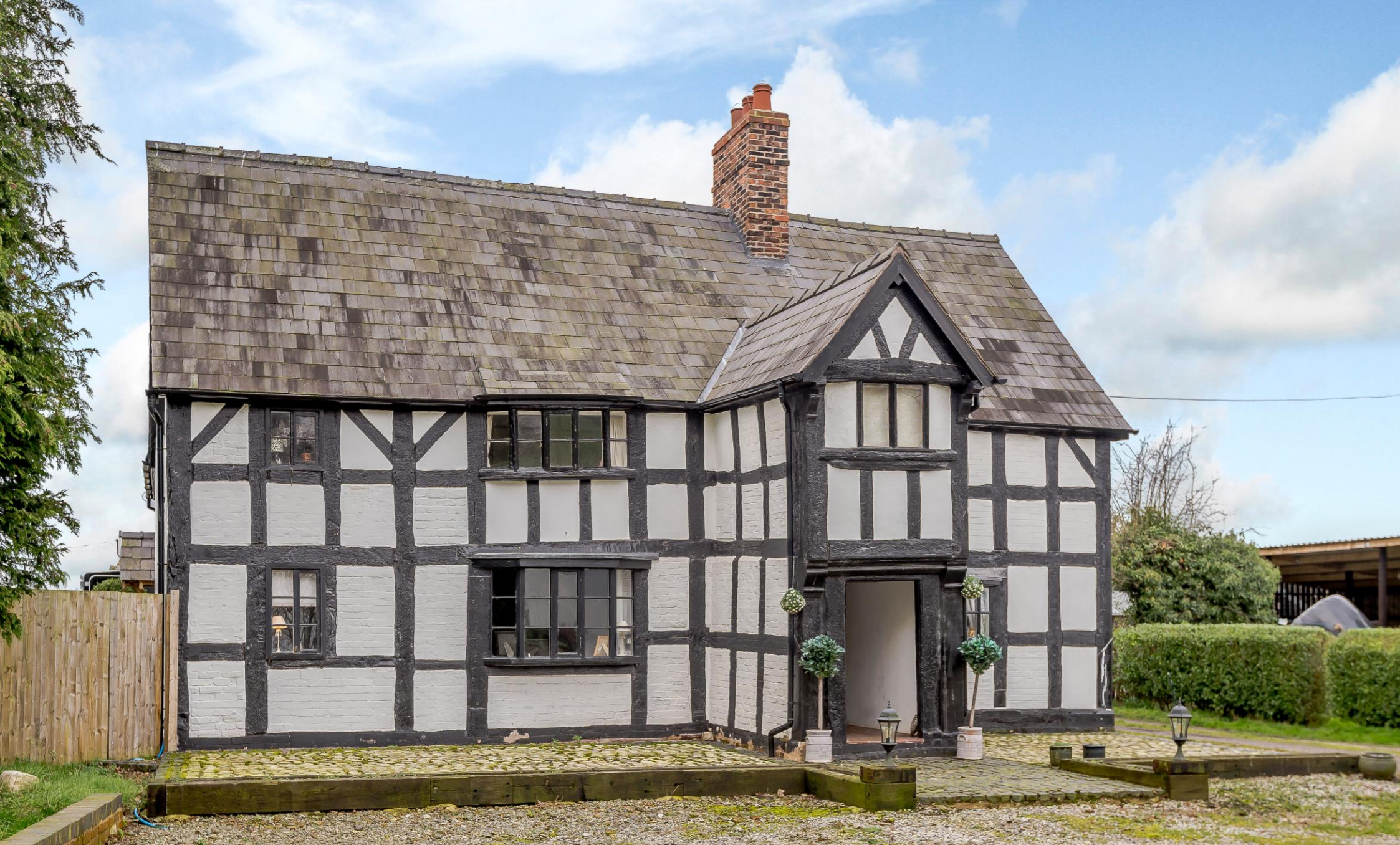
Hack House Nantwich, Cheshire